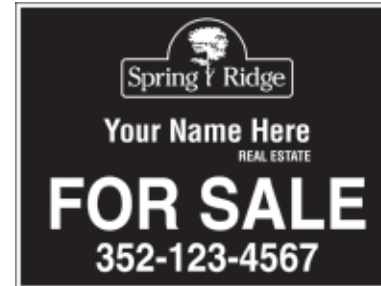
COROPLAST SIGNS 18" x 24" 2-sided sign Beige coroplast sign with Burgandy reverse